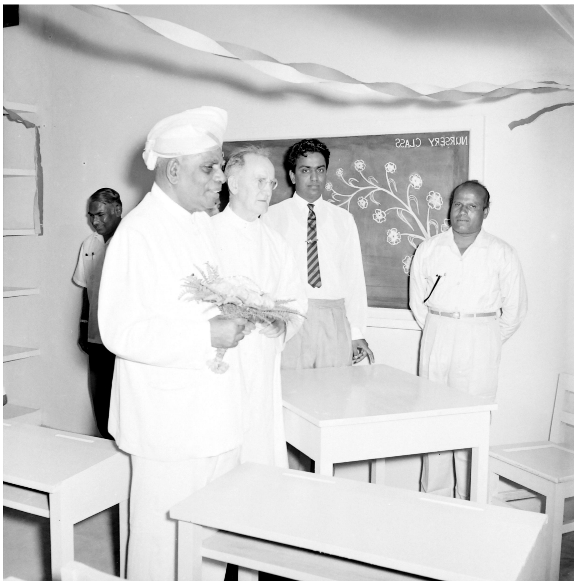
A mirror-image nursery class

IMG_0211, showing a classroom, confirms that this has happened, if indeed confirmation is required. There are freshly painted desks and chairs in the room, and the blackboard is marked with—what else—flowers, these being of chalk. But the blackboard also has 'NURSERY CLASS' written on it—in mirror image style !