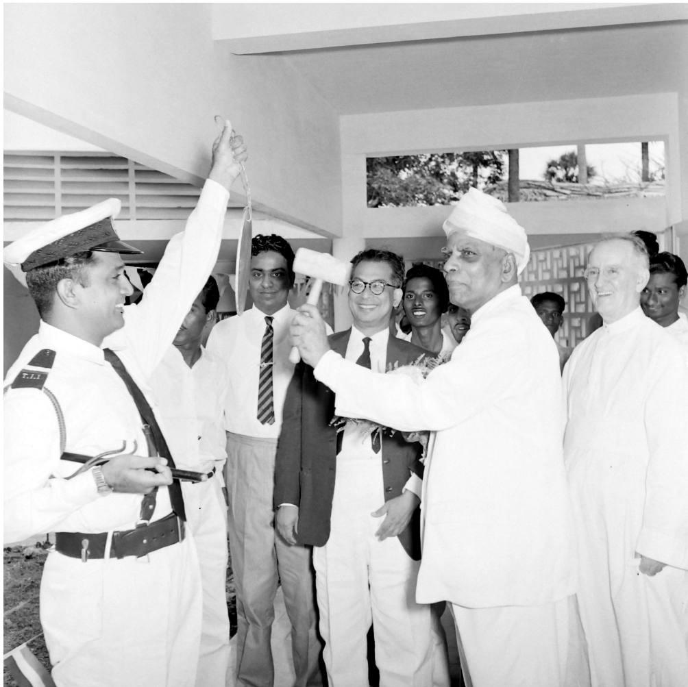
Striking the gong

ceremony. It tells you that the first students, little children, were treated to cool drinks on the first day of school and that they used gaily striped paper straws.