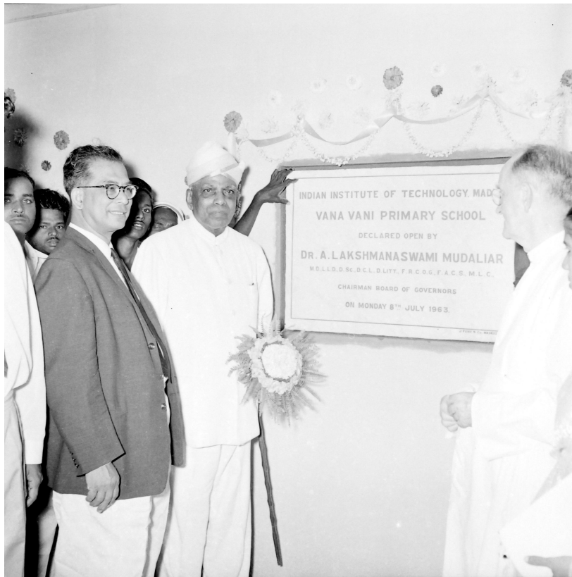
Opening of Vana Vani, 1963